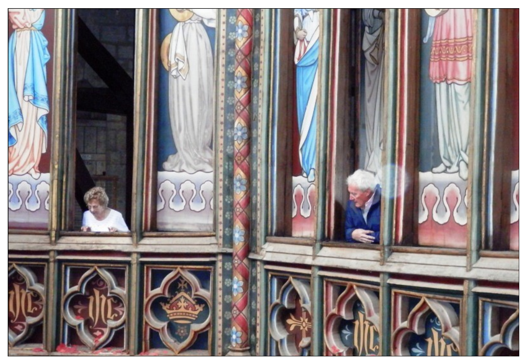
Top: The Lemsford Over 60s Group visited Ely on May 24th, and enjoyed the view from the Cathedral Lantern. Below: At a Service on 11th June we offered up our prayers and thanks.